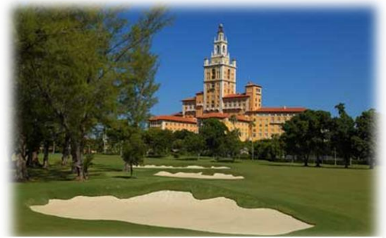
BILTMORE GOLF COURSE

Date: April 22, 2011 Time: 11:00 am – 7:30 pm Location: Biltmore Golf Course 1200 Anastasia Avenue Coral Gables, FL 33134 Format: 4 Person Scramble