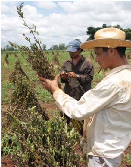
Paraguay farmers collecting sesame, a highly desired product in the international market. The "Paraguay Sells" program has helped to open new markets for small and medium scaled growers to increase their income, diversify their production and provide a better quality of life in rural areas