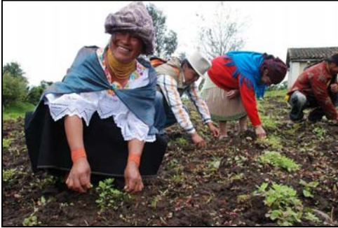
Residents of Ecuador's northern border region tend a field of quinoa, a traditional Andean grain. USAID programs in the area promote licit alternatives to drug trafficking.