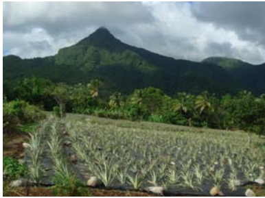
Improving production for export to select markets in Miami under the Caribbean Trade Expansion program (CTEP).